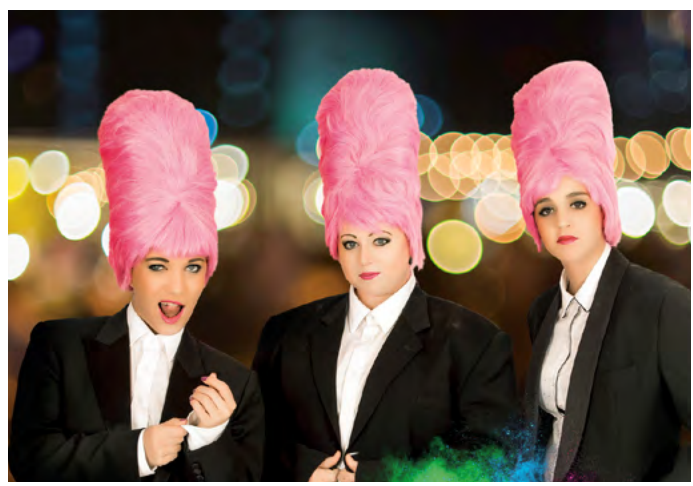
The Desperettes: A guide to being a Wingman "The three-part harmonies were a highlight as The Desperettes crisply covered a diverse range of tunes... putting their own lyrical slant on pop including Justin Timberlake and Beyoncé." - Arts Review