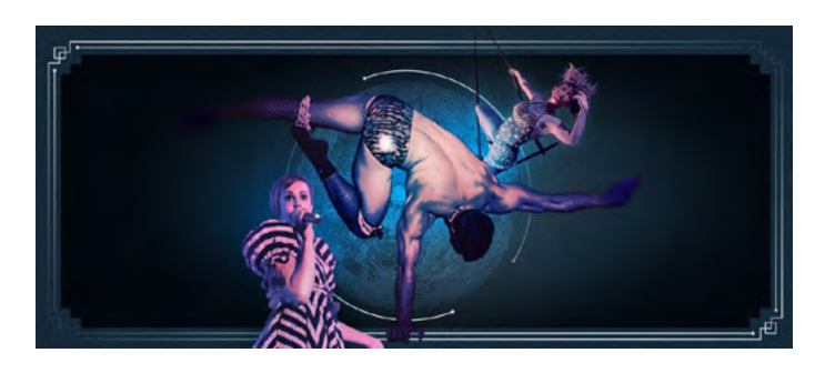
"Papillon Unplugged was first class!" - Audience Member