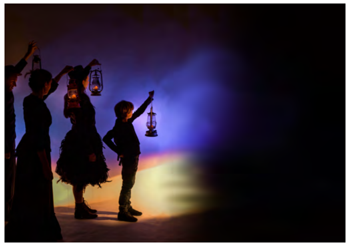
The Crow Family

"The performers spend much of the night hanging by a thread, albeit a chunky one. They climb, swing balance, slide, catch, pull, twist and caress a single piece of rope to the delight (and gasps) of the audience.—Stage Whispers