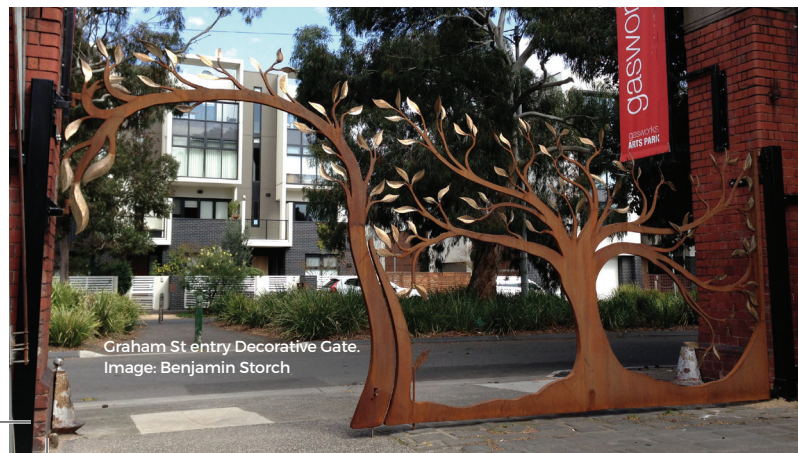
Graham St entry Decorative Gate. Image: Benjamin Storch