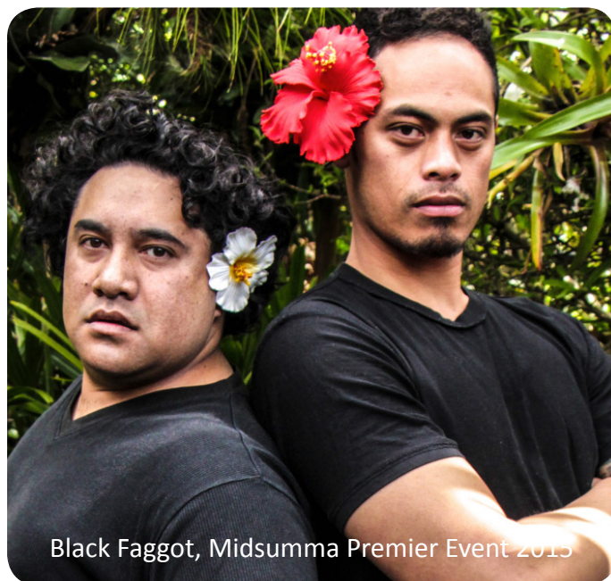
Black Faggot, Midsumma Premier Event 2015