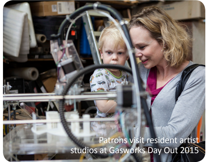
Patrons visit resident artist studios at Gasworks Day Out 2015

In the second half of 2015 we welcomed Albert Park College to our theatres, which organised drama and dance classes for students. Members of the community also actively chose Gasworks as the location for their special events and seminars.