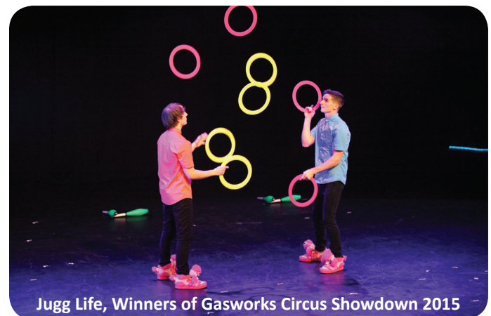
Jugg Life, Winners of Gasworks Circus Showdown 2015