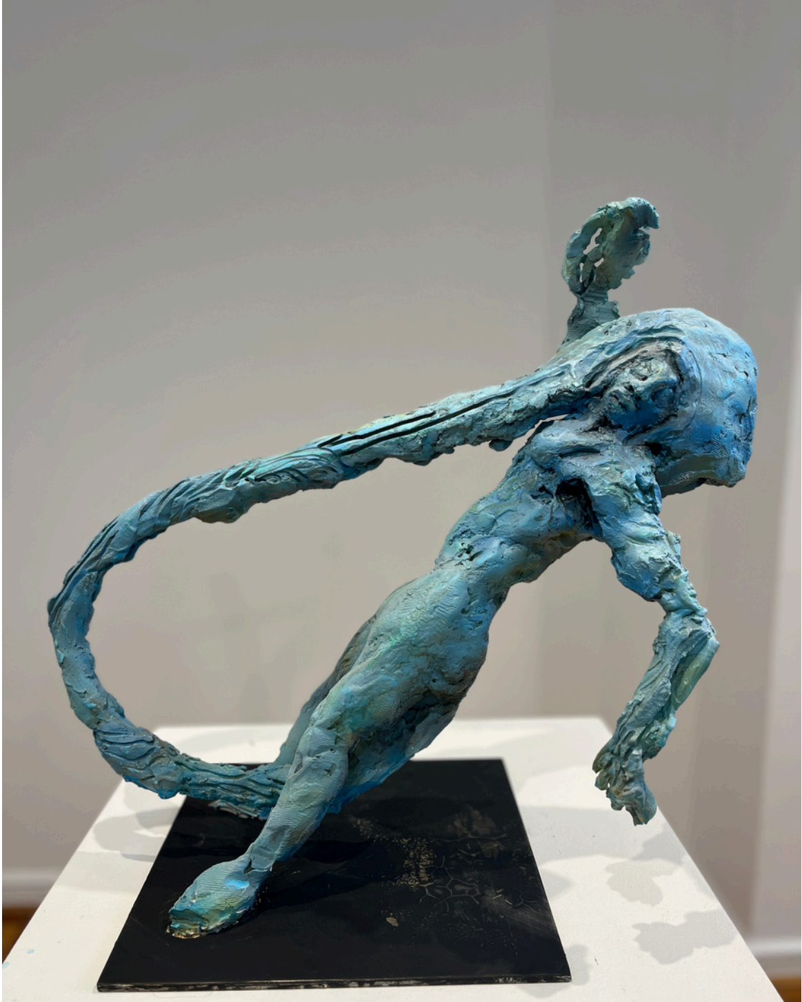
Asteria Ceramic, Metal Wire, Steel base POA