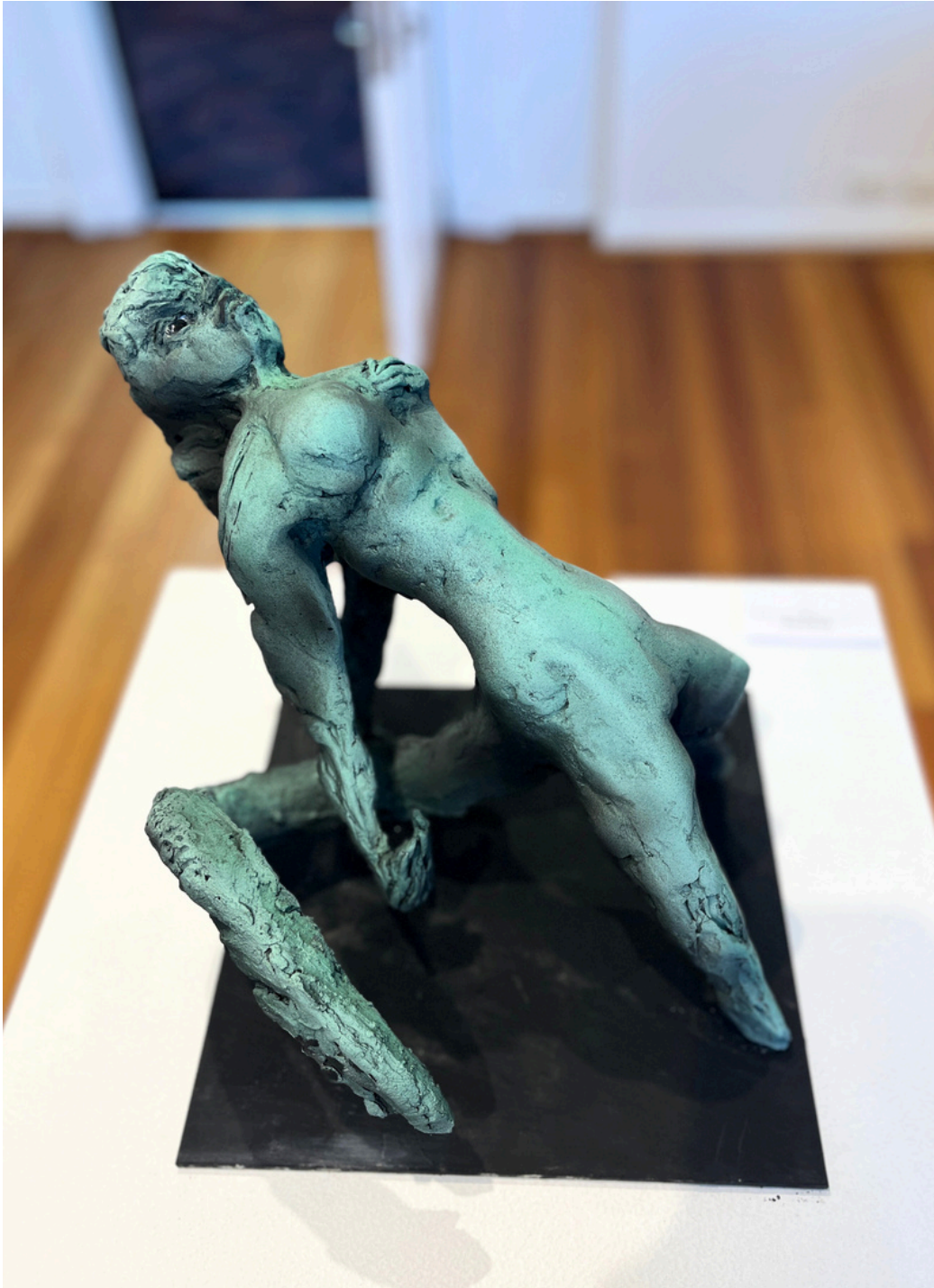
Inanna Ceramic, Metal Wire, Steel base POA