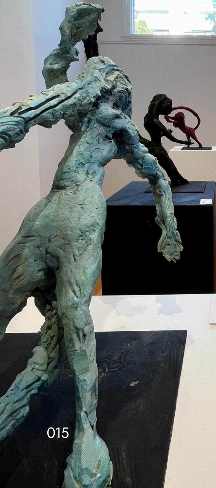
Asteris Cottone, 1998, 100 cm Pb