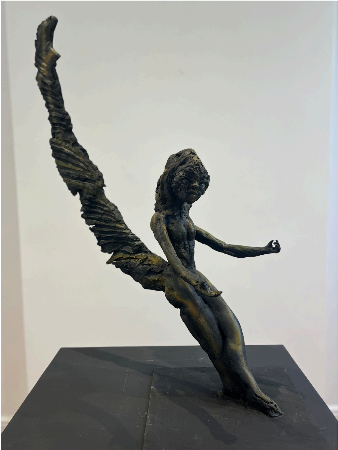
Sekhmet Ceramic, Metal Wire, Steel base POA