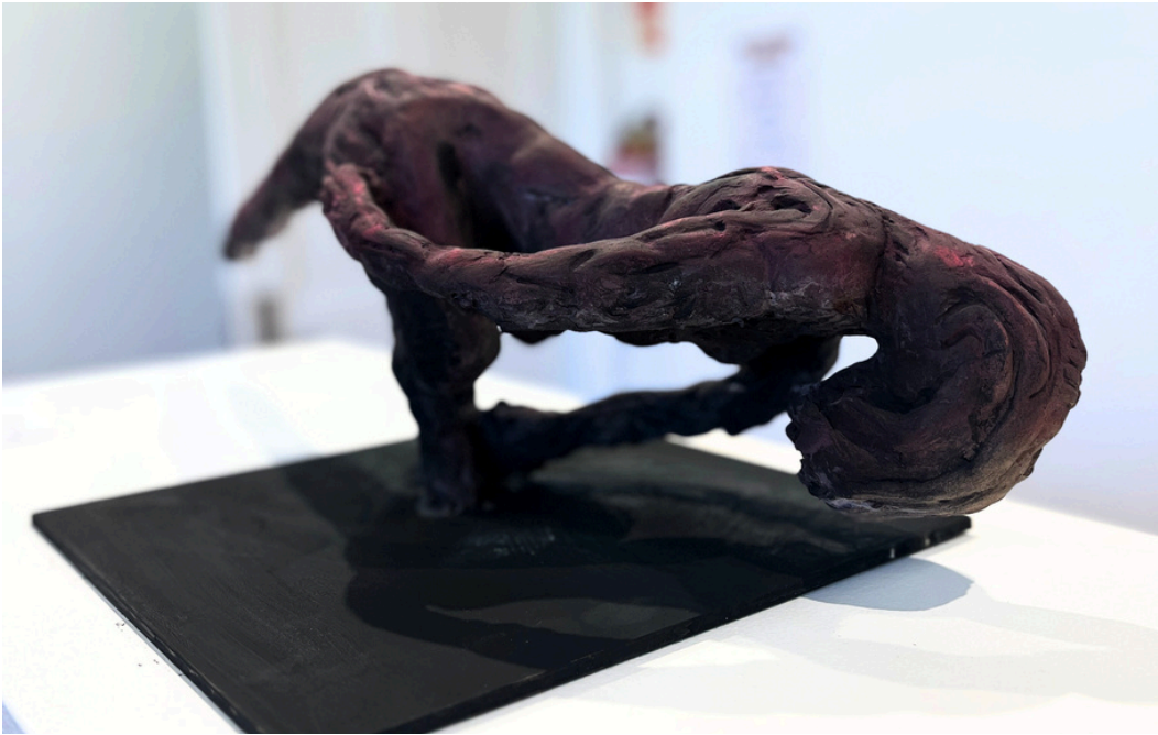
Calliope Ceramic, Metal Wire, Steel base POA