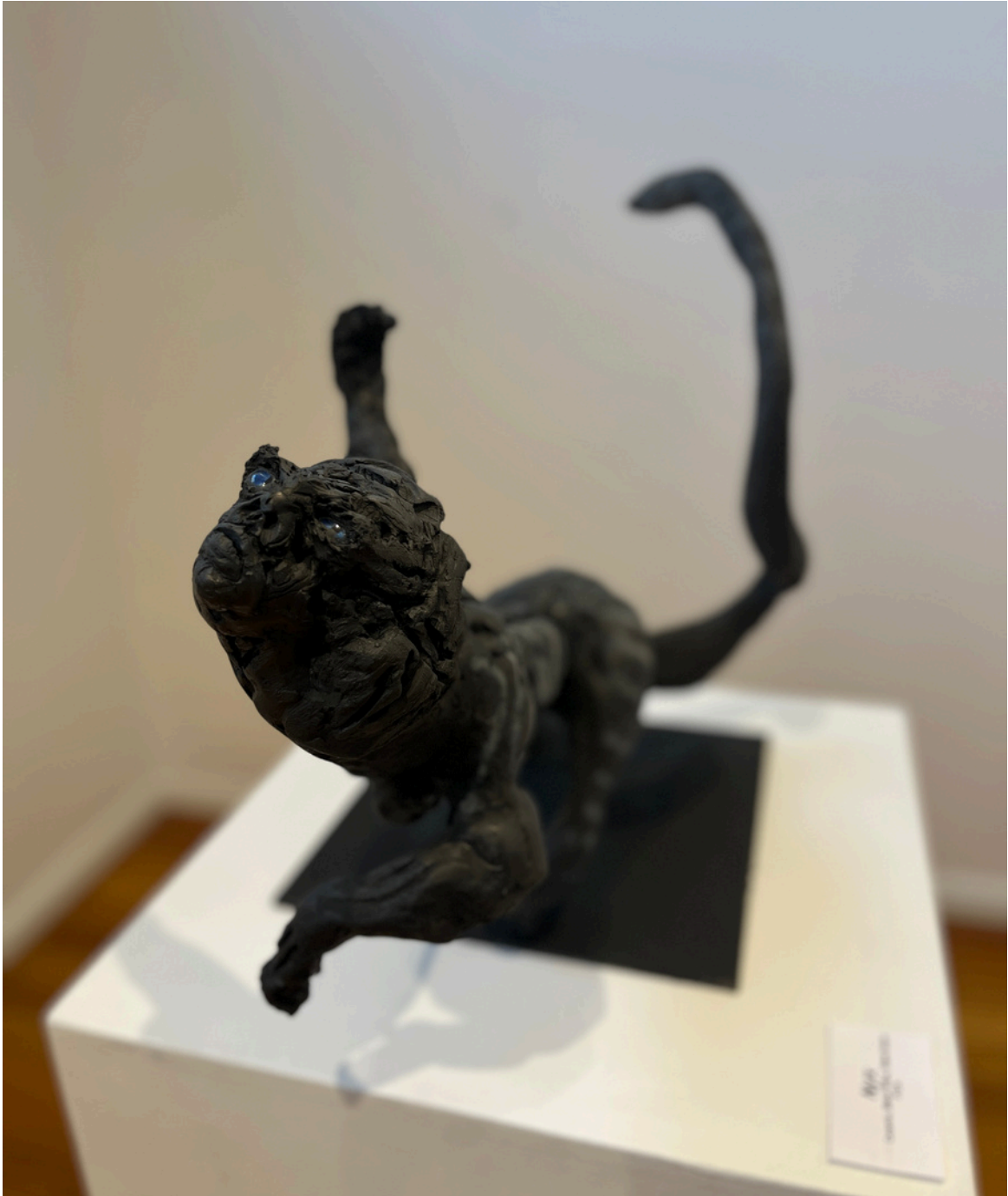
Nyx Ceramic, Metal Wire, Steel base POA