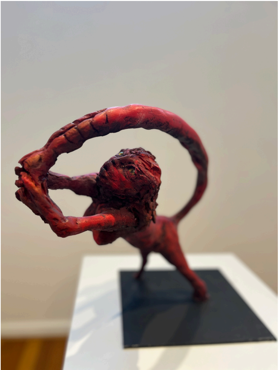
Tiamat Ceramic, Metal Wire, Steel base POA