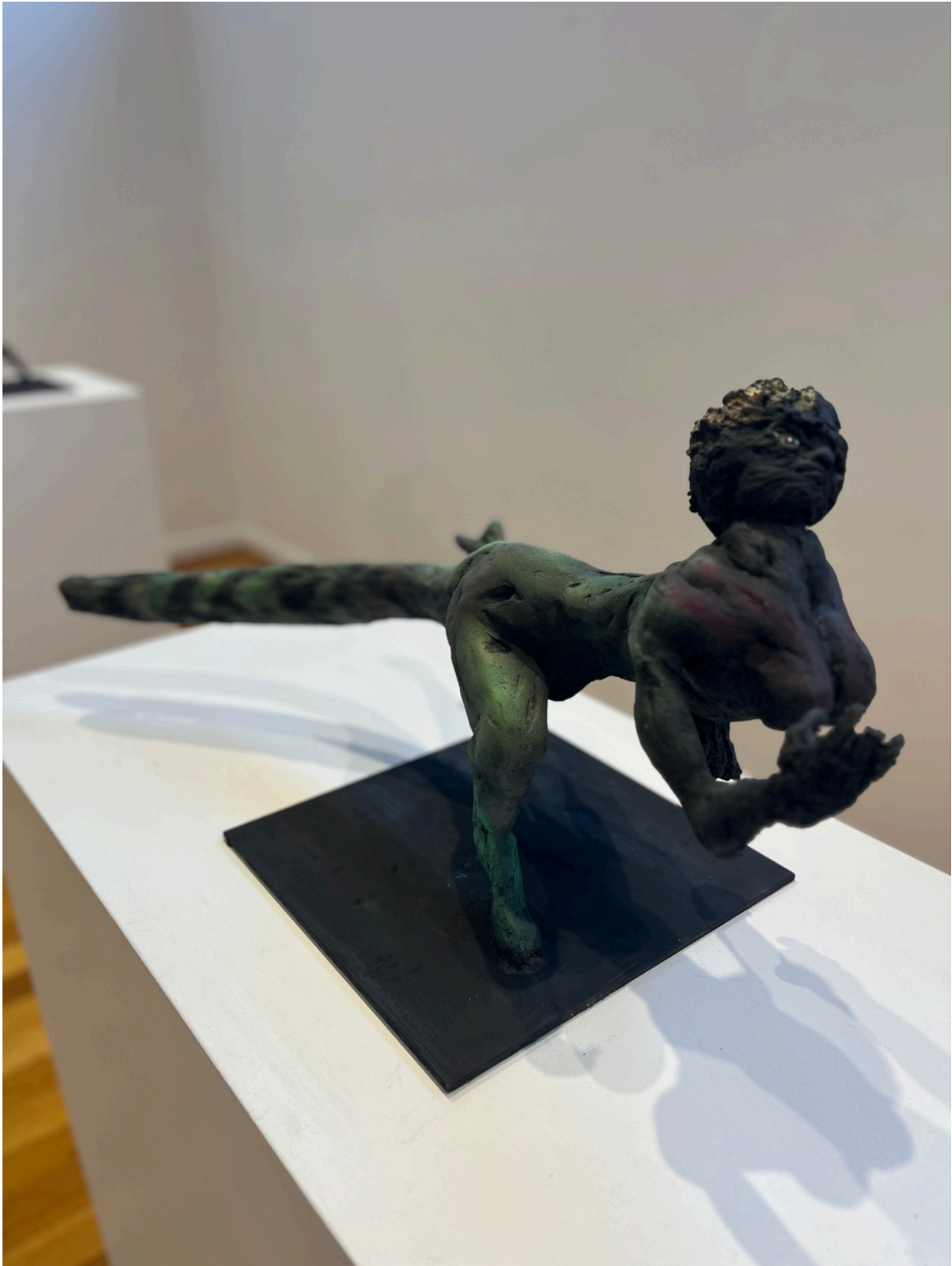
Amaltheia Ceramic, Metal Wire, Steel base POA